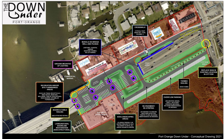
Port Orange Down Under - Conceptual Drawing 2021